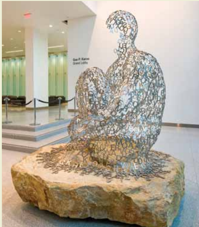
Cleveland Soul © Jaume Plensa 2007

These free tours provide a forum for conversation inspired by the renowned art collections of Cleveland Clinic and The Cleveland Museum of Art .